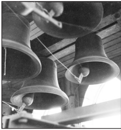
Iowa State University Library Special Collections Department